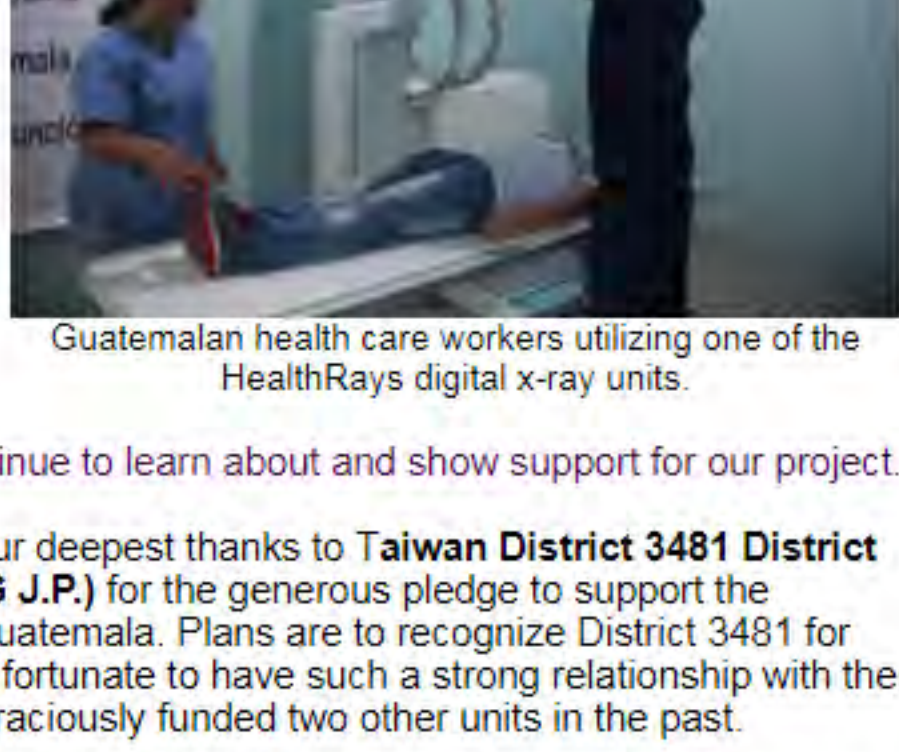
Guatemalan health care workers utilizing one of the HealthRays digital x-ray units.

Welcome to the latest edition of HealthRays® Update , an electronic newsletter that provides you with news and developments from the HealthRays initiative -- Rotary District 6440's effort to bring digital x-ray technology to needy populations in Guatemala -- and eventually, around the world.