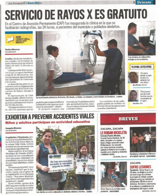
Guatemalan newspaper announces digital x-ray unit installation in Gualan.