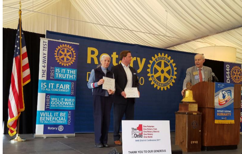
Certificate of Merits from the Guatemalan Ministry of Health presented at District 6440 Conference.

the WHIS-RAD machine used in helping to develop a digital x-ray system that would work successfully in third world country conditions. The use of this equipment in 2007-2008 was instrumental in the development of a low-cost, sustainable system that now has evolved into the HealthRays project in Guatemala. This