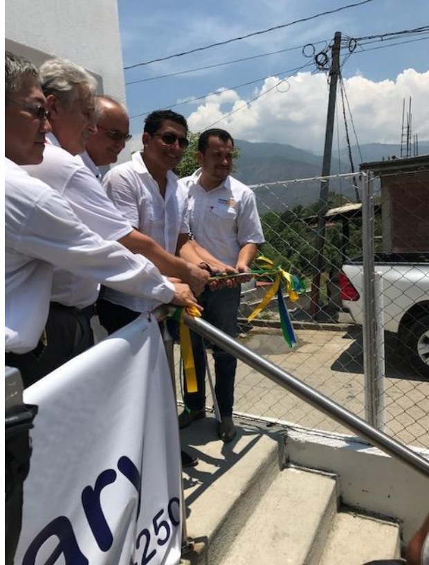
Ribbon cutting ceremony at May 25, 2017 dedication of clinic in Gualan, Guatemala.

Donations by Rotarians in Taiwan and the United States, provided through District 6440 HealthRays, were recognized.